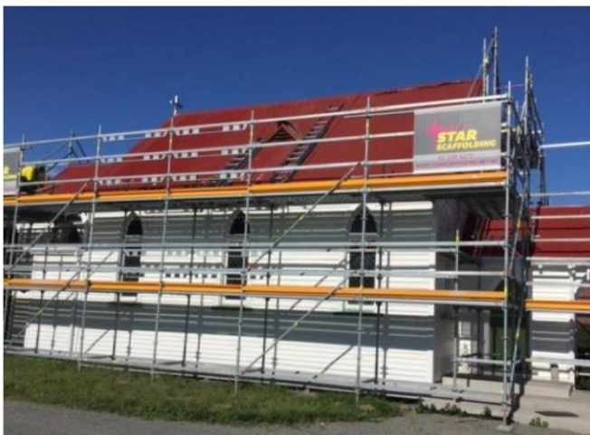
St Ita's Church

Historic St Ita's church has been undergoing extensive maintenance repairs, including roof replacement and painting. The church was a parish from Hinds in South Canterbury, first opened in 1911. By 2005 the parish was no longer functioning and subsequently closed. The church was then salvaged and relocated to the Heritage Village in 2006.